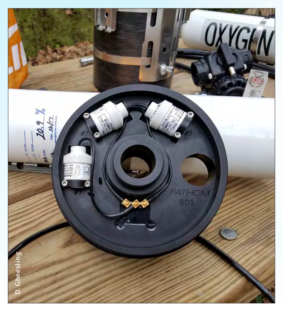
Fathom CCR head

radial scrubber is also available, which is far more practical for most divers. The flow through the scrubber is inside to out, which was determined to be slightly more efficient than outside to in during extensive testing by Peter Ready, the designer of the Prism Topaz rebreather. The scrubber is housed in a Black Amalgon canister, which is nearly indestructible and insulates the scrubber four hundred times better than aluminum. Constructed of fiberreinforced thermoset epoxy matrix, Black Amalgon features an ultra-smooth inner surface. It is a lightweight, high-strength, corrosion-resistant composite alternative to aluminum. Both the head and bottom are CNC machined Delrin and secured to the canister with a strong and simple latchless line-lock design that streamlines the profile and eliminates snags or broken latches. With both the head and bottom in place, the scrubber canister measures 16 in/406 mm tall and 7 in/178 mm diameter. The canister bottom has a recessed water trap that holds 6 to 8 chammies to absorb condensation and small amounts of water. The stock canister also accepts the 8 lb/3.6 kg Meg radial scrubber and the Cis-Lunar radial scrubber.