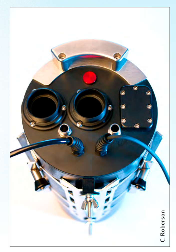
Sensor array inside the Fathom CCR head

The only real drawback of a CMF system is a depth limitation that is reached when the first-stage intermediate pressure is equal to the ambient pressure. For example, a CMF system with a 145 psi/10 bar intermediate pressure (IP) has a practical depth limit of 260 fsw/81 msw.<sup>1</sup> The Fathom CCR addresses this by modifying an Apeks DS4 with a stronger spring that allows for much higher intermediate pressures. The first-stage intermediate